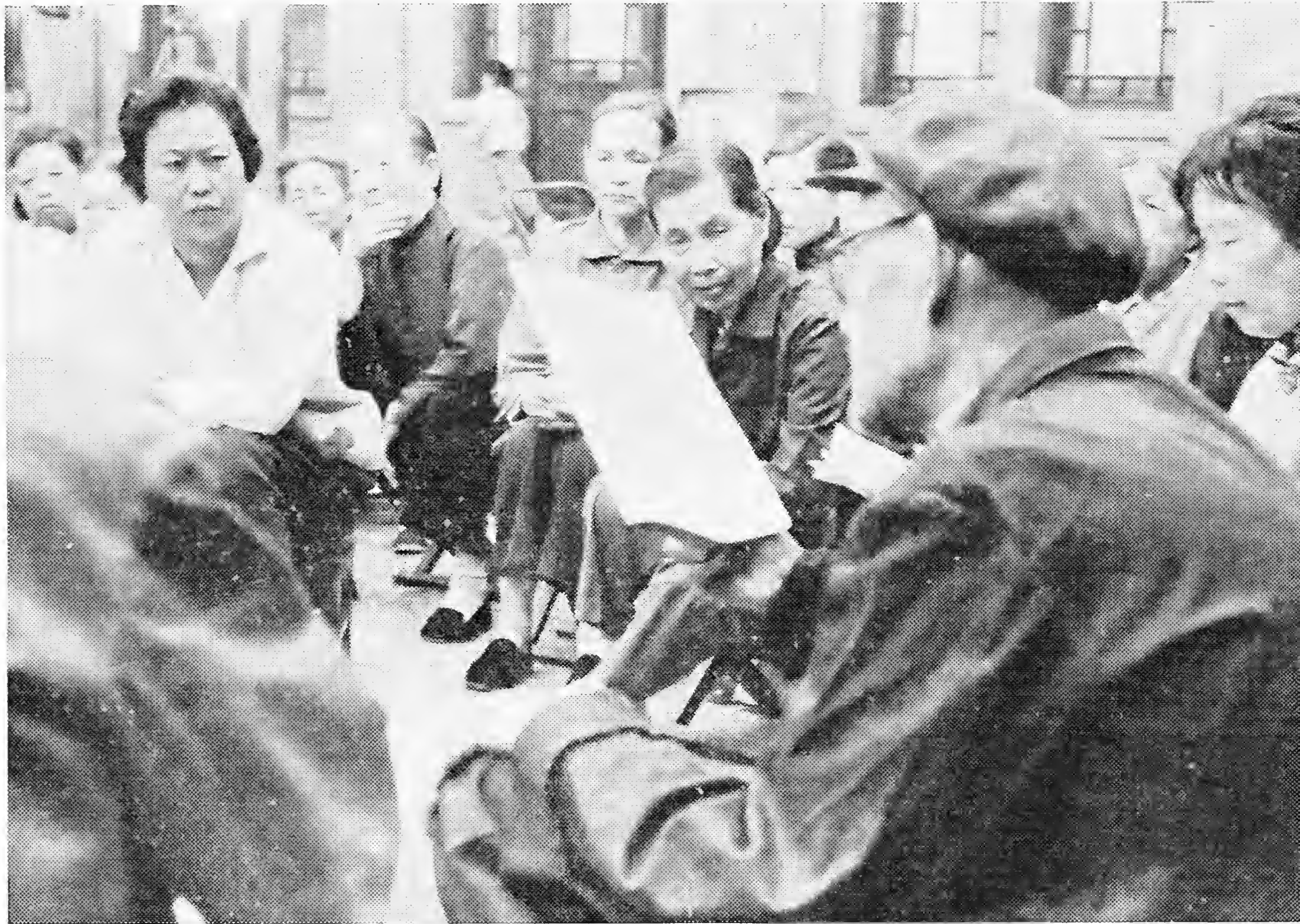
People of Fengsheng neighborhood, Peking, in one of the groups they have organized to study current affairs.